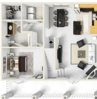
▲ MAYFAIRE LOFT 1 BED | 1 BATH 1,548 SQ. FT