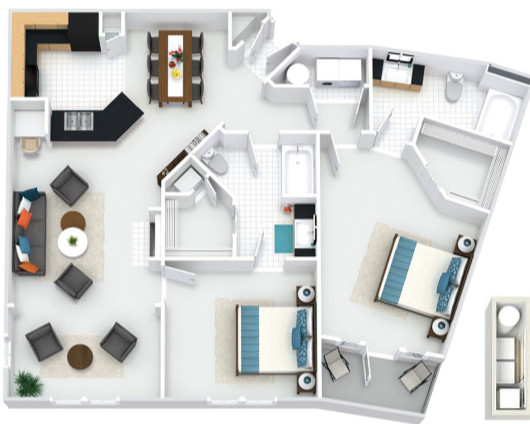
▲ ABBEY II 2 BED | 2 BATH 1,375 SQ. FT