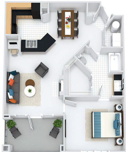
▲ KENSINGTON PATIO 1 BED | 1 BATH 792 SQ. FT