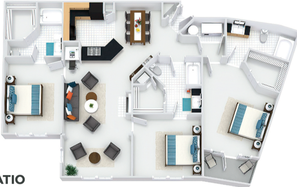
▲ ABBEY III 3 BED | 3 BATH 1,589 SQ. FT