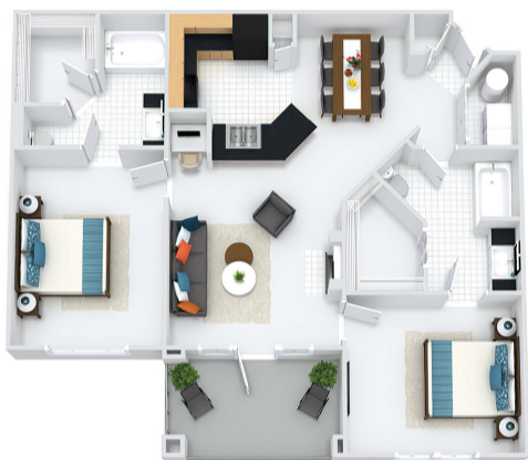
◀ BRISTOL PATIO 2 BED | 2 BATH 1,083 SQ. FT