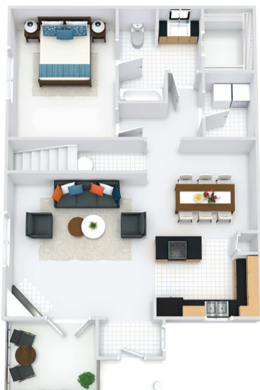
▼ REGENTS PATIO 1 BED | 1 BATH 931 SQ. FT